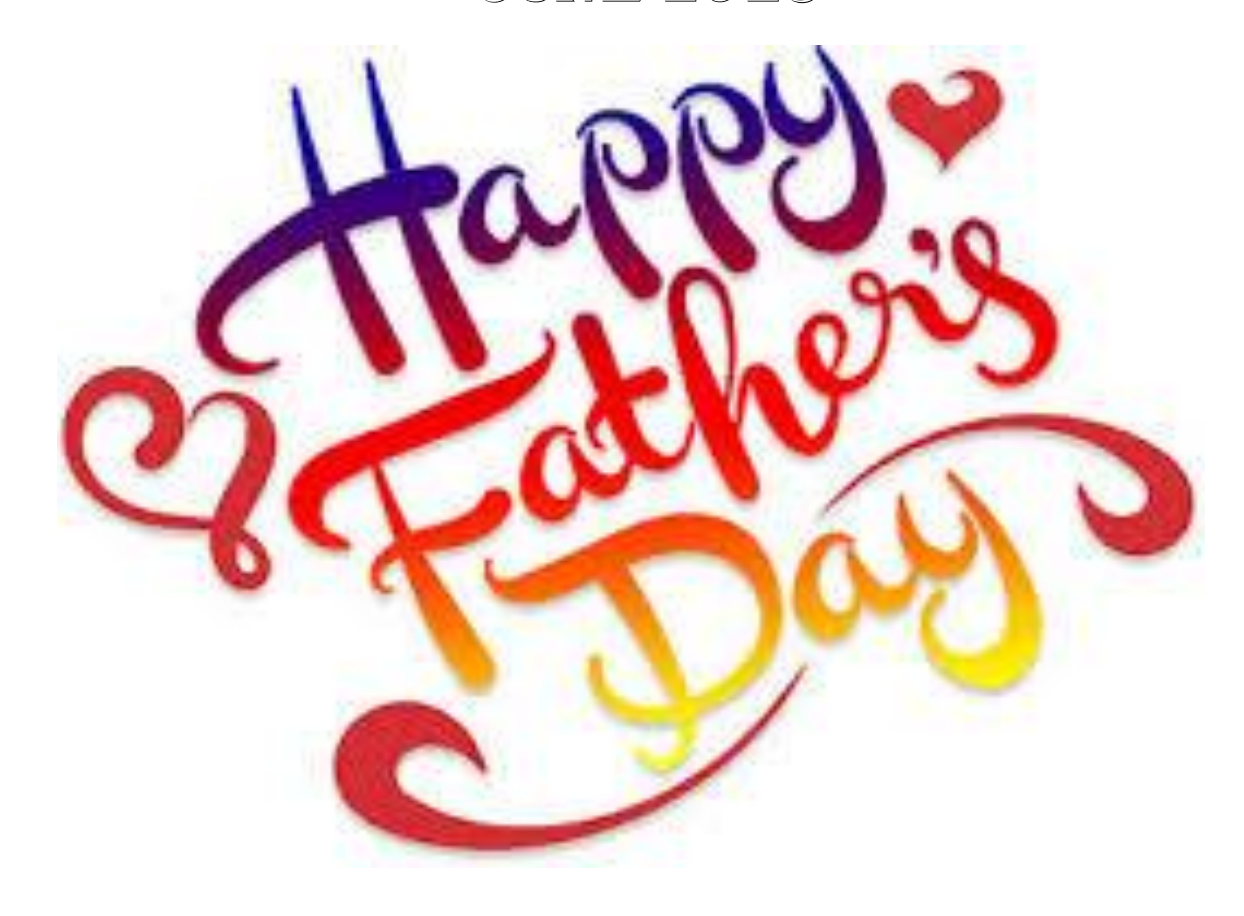
IMMANUEL LUTHERAN CHURCH, ELCA 631 Grand Street, Allegan Michigan