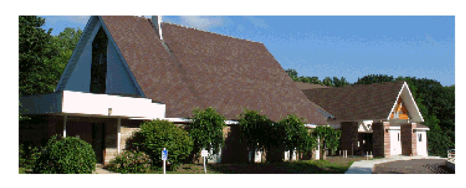
October 2023 Volume 1, Issue 10