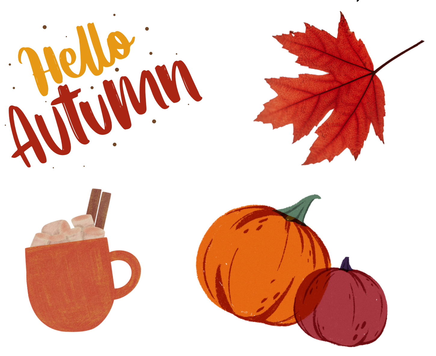
Immanuel Lutheran Church, ELCA 631 Grand Street, Allegan, MI